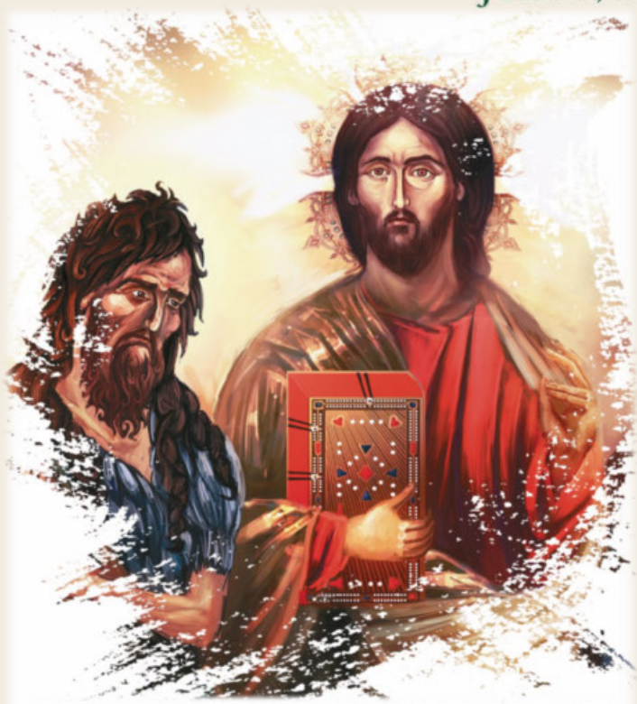
"COME TO ME, ALL YOU WHO LABOR AND ARE BURDENED." -MT 11:28

Our Mission: A Roman Catholic Community celebrating Christ's presence among us.