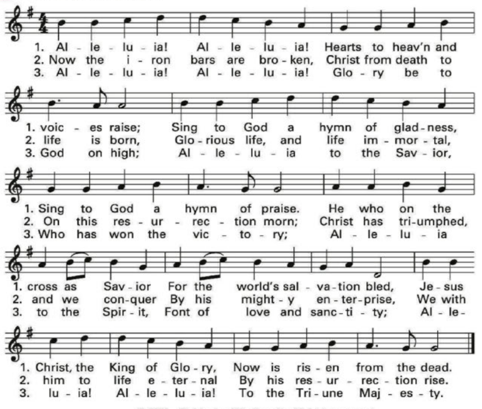
© 1872, Christopher Wordsworth. All rights reserved.